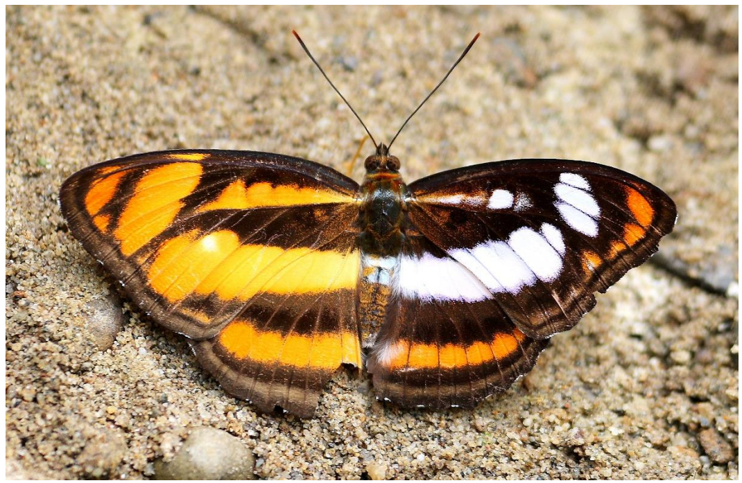
Date of Publication: 24th April, 2022